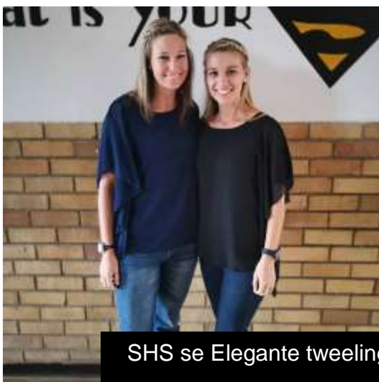
SHS se Elegante tweeling.