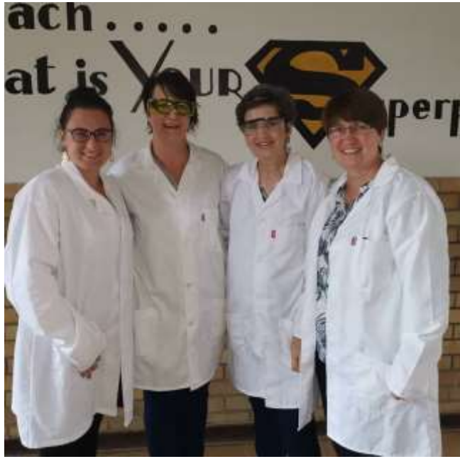
SHS se professors.