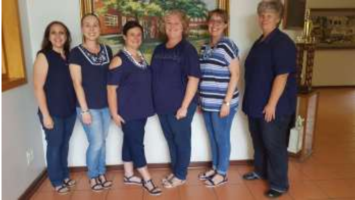
SHS SE ADMINISTRATIEWE SESING