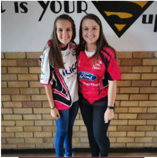
SHS se 2 hokkie bakkies.