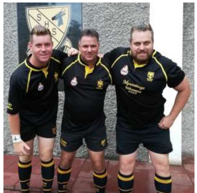
SHS se grooot manne.