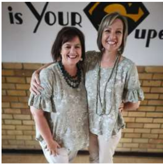
SHS se glimlag Juffrouens.