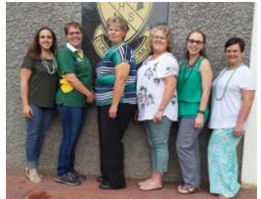
SHS gaan "Groen"