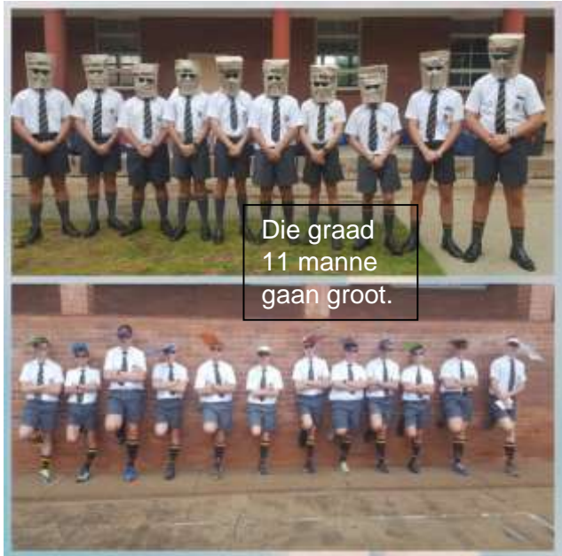
Die graad 11 manne gaan groot.